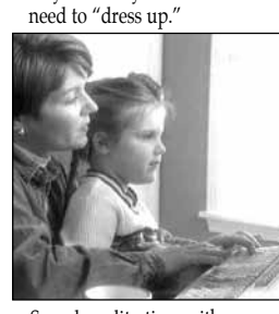
Spend quality time with your little ones...no daycare costs