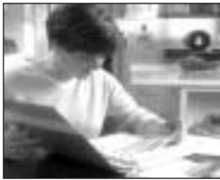
When You Work at Home...

Your instructors are experts... and they're ready to help you. Most of our students have very few questions. But if you do have a question, just pick up the telephone and call our toll-free number. An expert instructor will give you the answer you need.